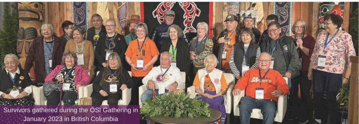
Survivors gathered during the OSI Gathering in January 2023 in British Columbia

The Secretariat attended several Gatherings hosted by the Office of the Special Interlocutor throughout the 2022-2023 fiscal year. As well as attending a Gathering hosted by the Nishnawbe Aski Nation, exploring technologies and techniques for conducting ground searches. These events serve as an opportunity to connect with other communities and share strategies.