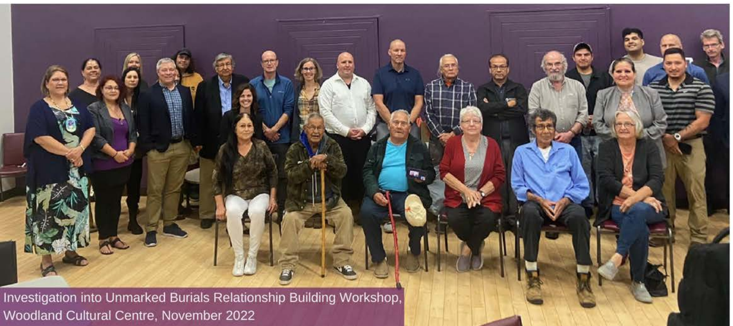
Investigation into Unmarked Burials Relationship Building Workshop, Woodland Cultural Centre, November 2022

The Coroner's Office will work within the Coroner's Act utilizing the powers within to assist and support the work of the Survivors' Secretariat. We are actively working with the Coroner to determine the path forward.